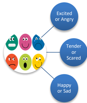
Image 3. 6 basic emotions by P. Ekman

distrust, surprise-anticipation). There are types of emotions by Paul Ekman on the Image 3.